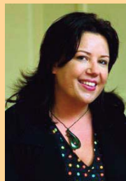
Hon Paula Bennett Social Development & Employment Youth Affairs