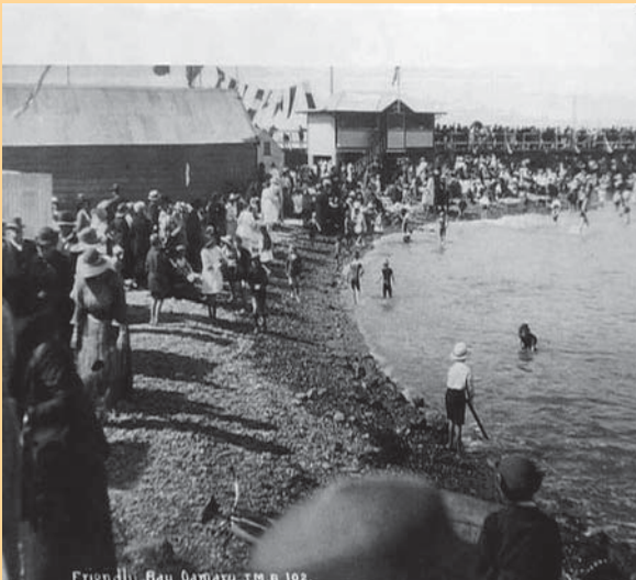
Friendly Bay as it was in times gone by