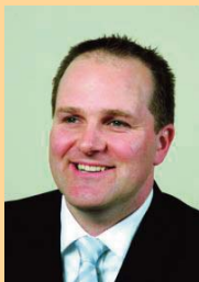
Hon Simon Power Commerce