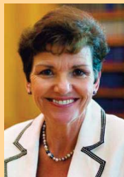
Hon Anne Tolley Education Tertiary Education