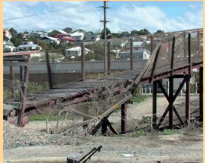
Friendly Bay as it is today